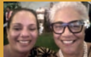
Lemau Pala'amo & Hon Fiaime Naomi Mata'afa, Samoa